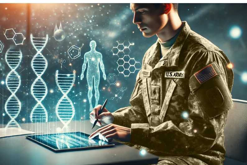
Simulated OPS Cell and simulated use of AI enhancing capabilities.